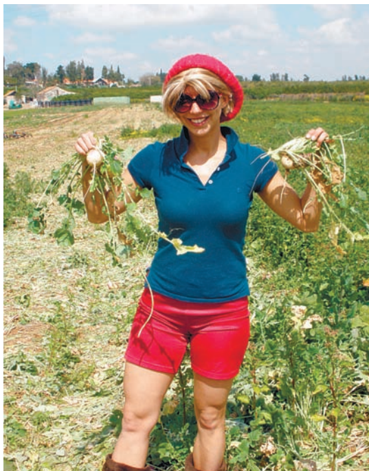
A participant on an Israel Way program picks radishes on a kibbutz

"We want to open eCamp to as many campers as possible," says Tamir. "After a successful pilot last summer we are now running eCamp Max, a special program for kids with Aspergers syndrome, PDD and high functioning autism. eCamp MAX really helps the campers